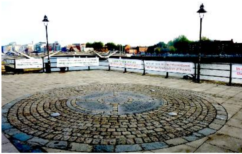
The Human Rights and Poverty Stone, next to the Famine Statues on Custom House Quay