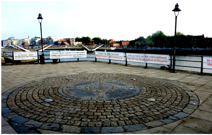
The Human Rights and Poverty Stone, next to the Famine Statues on Custom House Quay

Joseph Wresinski, the initiator of the UN Day, was convinced that children have an important role in the movement to end poverty. By giving them an understanding of what poverty is, and empowering and inspiring them to take action against it, we are nurturing the future advocates of social change. As such, we have created an age appropriate, positive and nationally inclusive activity to establish children's presence at the heart of this historic occasion.